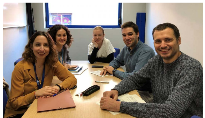
VHIO COLOSSUS study team

Further information about the study and the sites can be found at cancertrials.ie , clinicaltrials.gov and https://www.colossusproject.eu/the_project/colossus-translational-study/ .